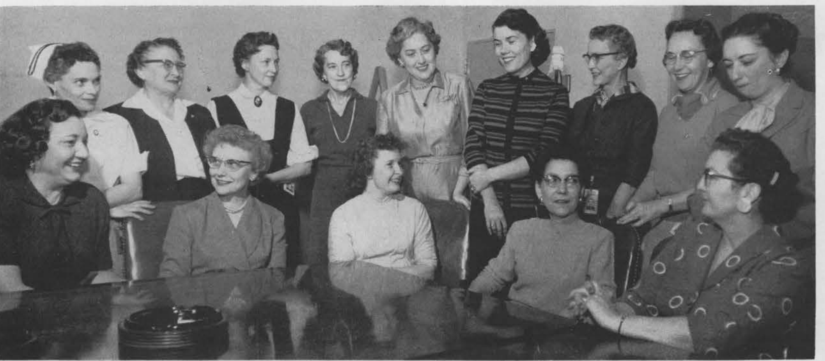
WOMEN as leaders fill need in industry-some of Sandia's 20 women in supervisory positions.